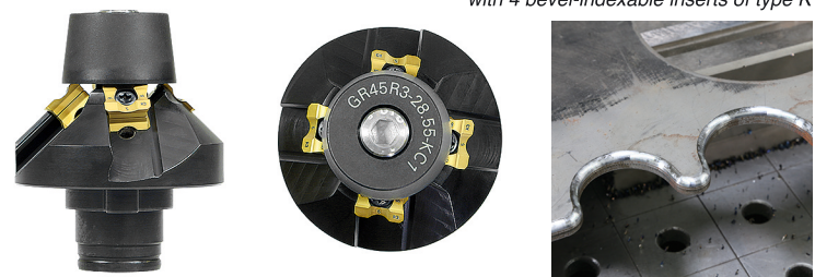
fig. 45°-radius-milling head with 4 cutting edges and guide roller, equipped with 4 x 3 mm-radius-indexable inserts of type R-K