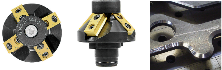
fig. 45°-bevel-milling head with 4 cutting edges and guide roller, equipped with 4 bevel-indexable inserts of type K

For each milling head (bevel, radius), specially coordinated guide rollers are offered. These guide rollers also enable the machining of inner and outer contours and boreholes.