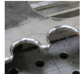
fig. 45°-radius-milling head with 3 cutting edges and guide roller, equipped with 3 x 3 mm-radius-indexable inserts of type R-K